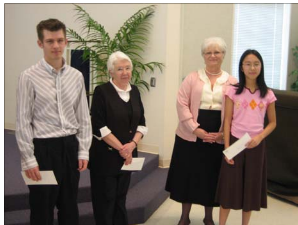
A couple of the fine teachers and winners of the 2006 Sonatina Competition. Come in March to hear winners of 2007!